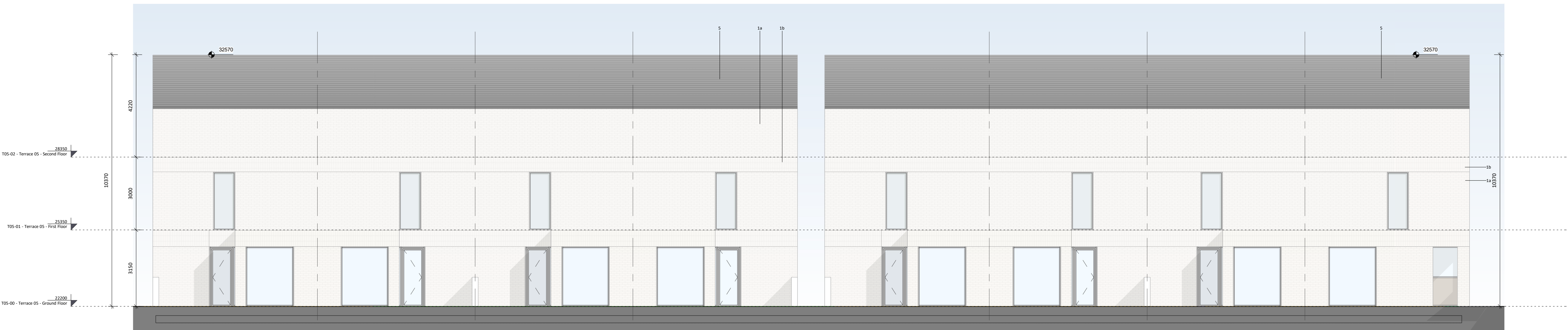
3 T05 West Elevation A 1 : 100