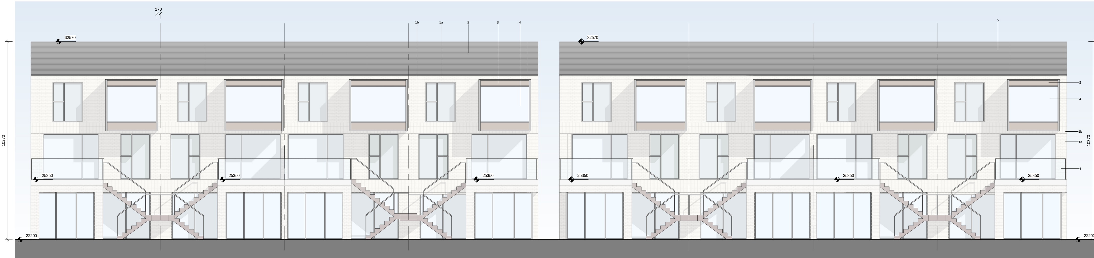
1 T05 East Elevation A 1 : 100