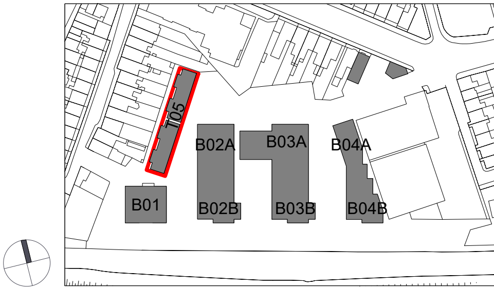
SITE KEY PLAN